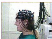
a. Adult optode array