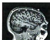
b. Adult MRI co-registration