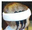
c. Infant optode array